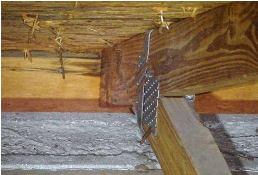
Single wrap with at least 2 nails in the embedded side and at least 1 nail in the wrapped side