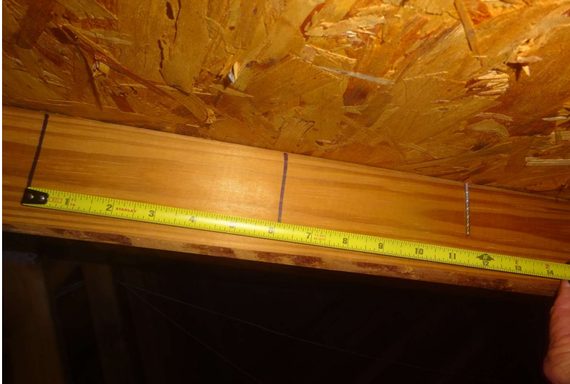
6" spacing in the field