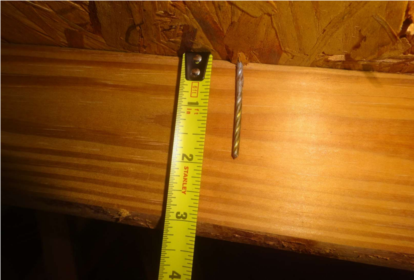
8d nails verified