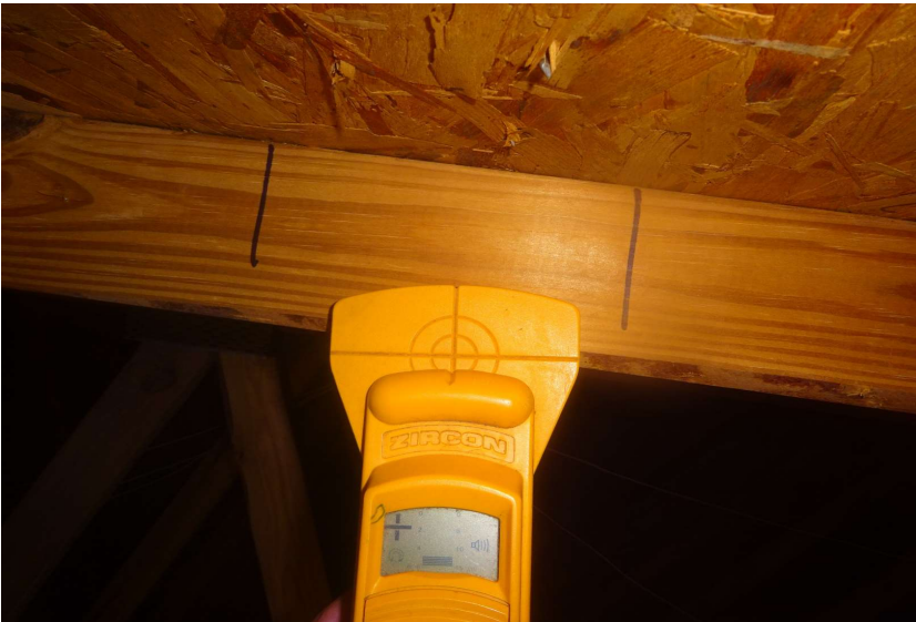
Nail location verified